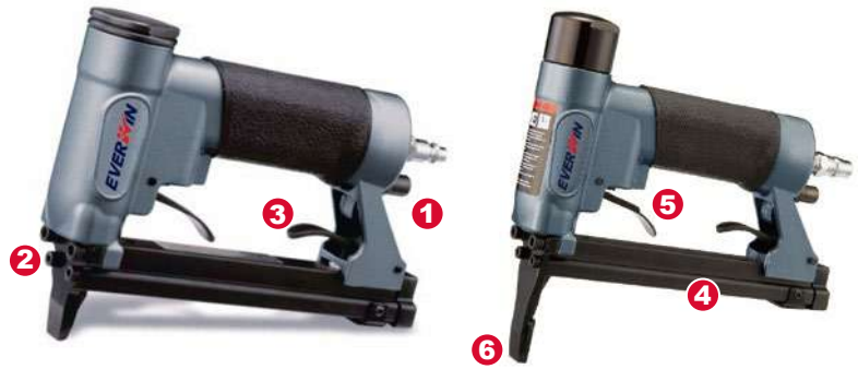
US series Single fire, short nose